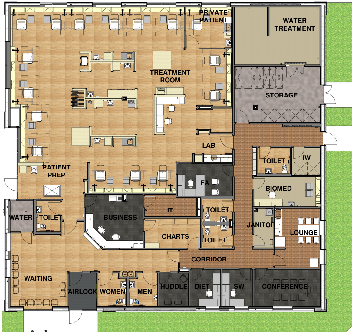
16 STATION DIALYSIS CLINIC